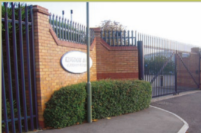
Pallisade fencing with manual gates to match, lockable by key.