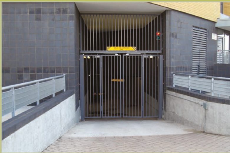
Bi-folding gates with traffic light system, access control and overpanel. 'Alleygate' design (a basic railing gate)