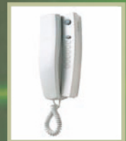
Internal handset for an Intercom system