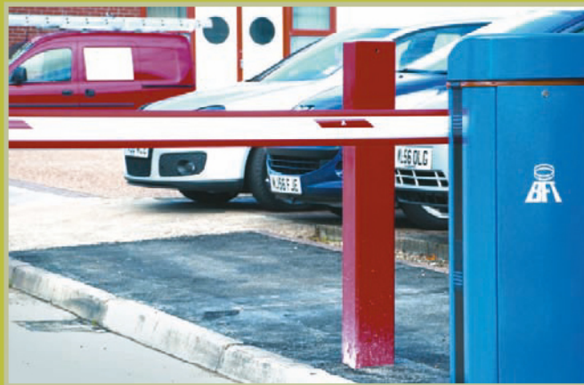
Automated Barrier with protective steel post installed next to it