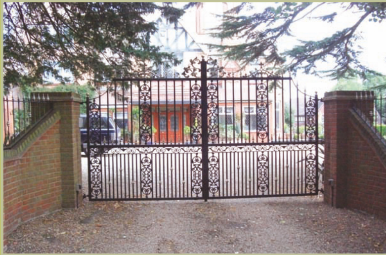
Traditional gates and railings, automated by hydraulic rams. 'Victoria' gate design