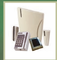
Readers and automation accessories