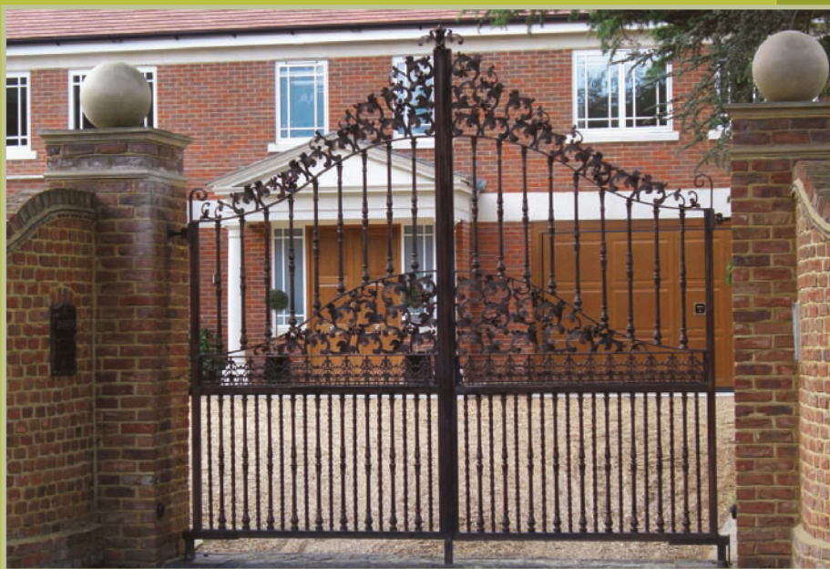
Gates with intercom system, powdercoated bronze, Harling 'Windsor Leaf' design