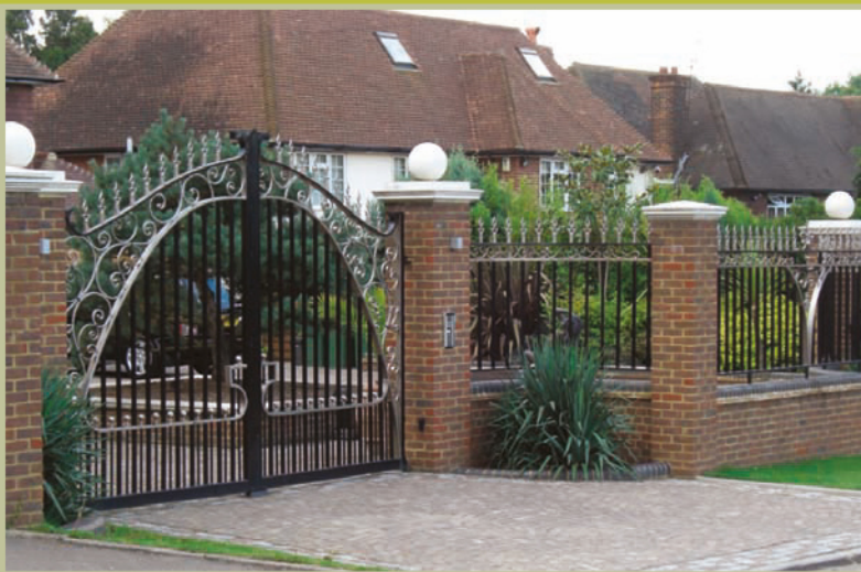
Decorative Gates and Railings, bespoke design, fully automated with Intercom system.