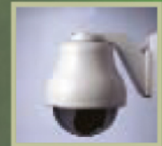
Wall mount vista dome