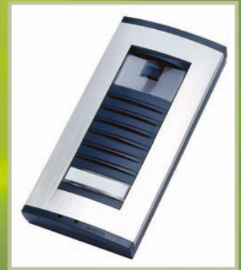
Targha video panel for an Intercom system