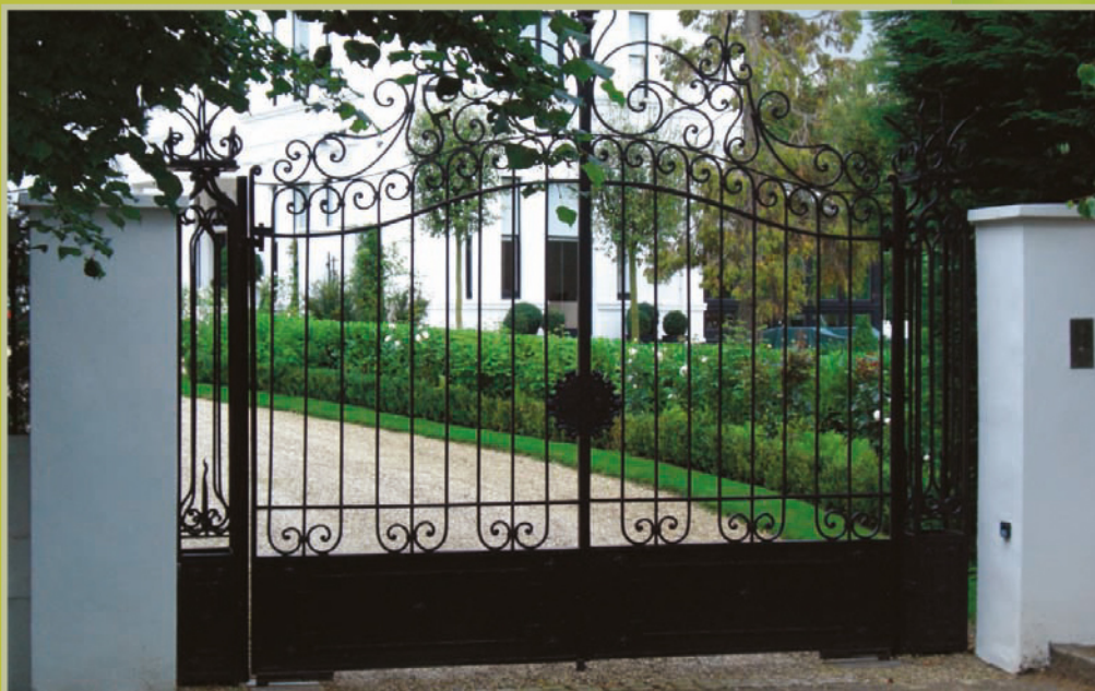
Grey powdercoated steel gates made to suit customers own design, automated with below ground operators