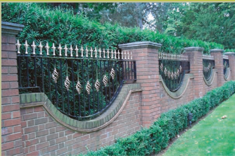
Decorative Railings, that were manufactured to match a pair of gates, a basic railing design with finials on top and twist scrolls in the centres.