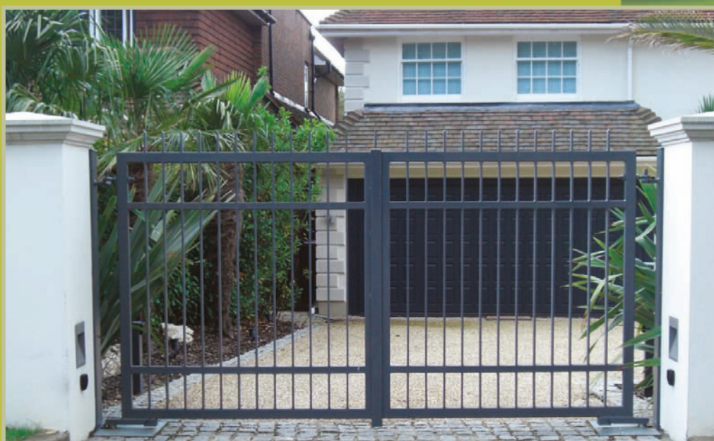
Grey powdercoated modern gates, with below ground operators. Harling 'Milton' design