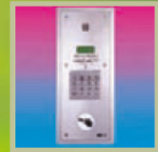
Digital Intercom panel