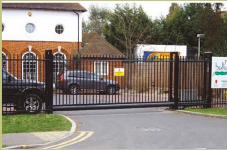
Harling 'Alley gate' design, sliding gate with cantilever action. This avoids having a ground track for the gate to run on.