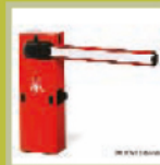
Automated Barrier available in a range of colours including stainless steel