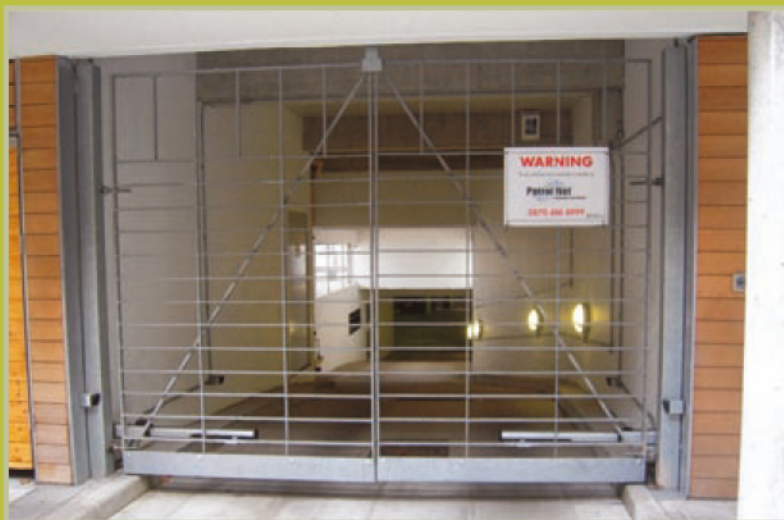
Galvanised double swing gates, automated by hydraulic rams. Manufactured to Architects design