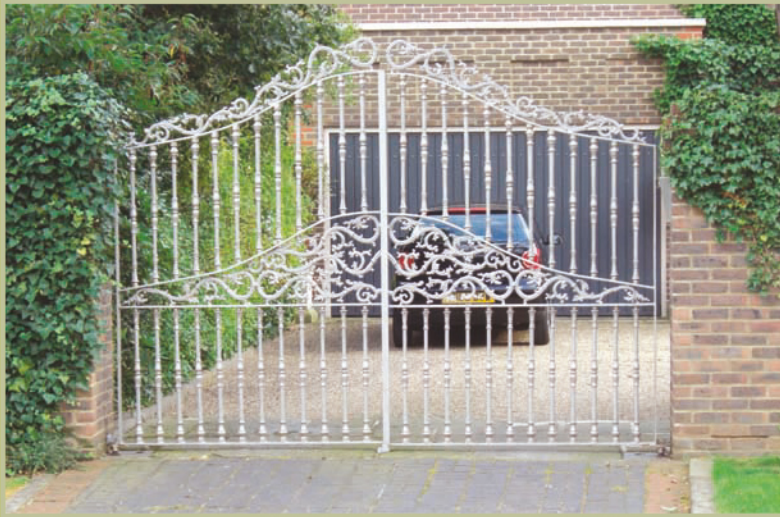
Decorative Gates powder coated silver for a residential project. Gates were a bespoke design