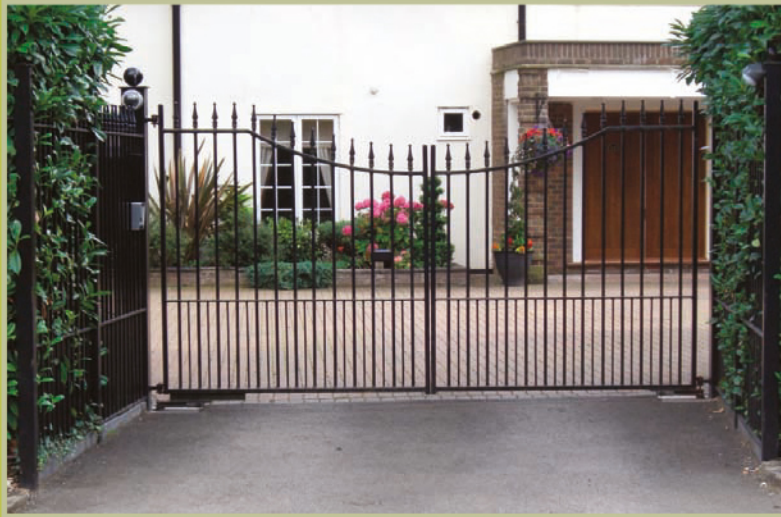
Automated Gates and Railings with basic railing design and dog bars at the bottom