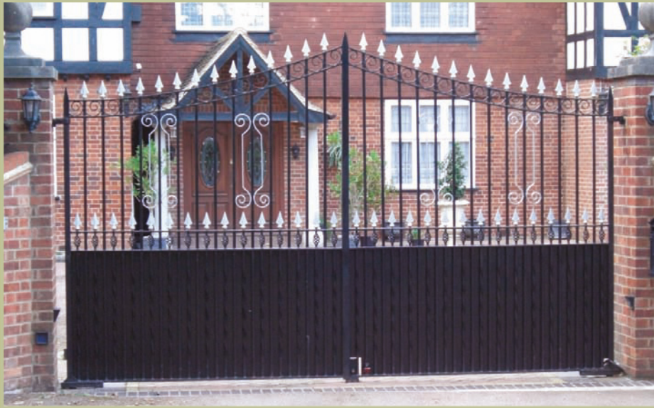
Gates with privacy panel, dog bars with below ground operators and gold painted infills. Harling 'Albert' design