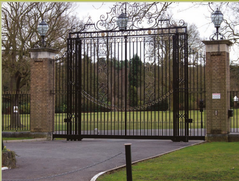
Large sliding gate with decorative infill, access control and traffic light system with ornate support posts and top arch. Gates were a bespoke design