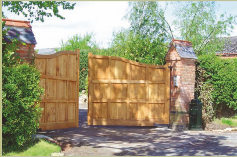
Automated wooden gates, with hardwood panels. Oakdene design