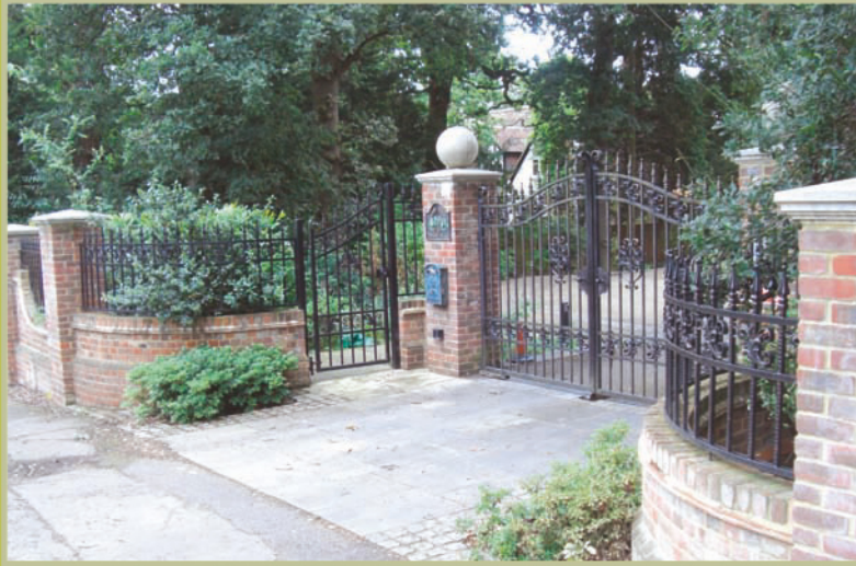
Steel gates with pedestrian gate and curved railings to match