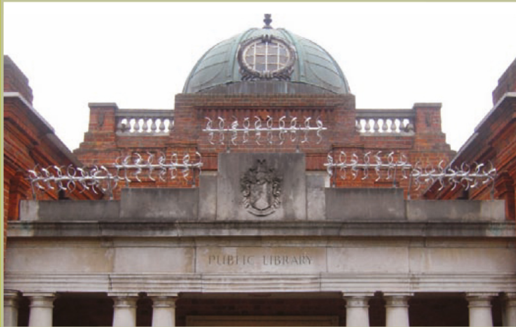
Anti climb, Rotating spikes