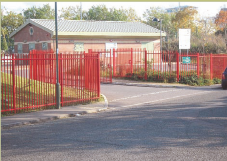
Railed type fencing incorporating vehicle gates, manually operated