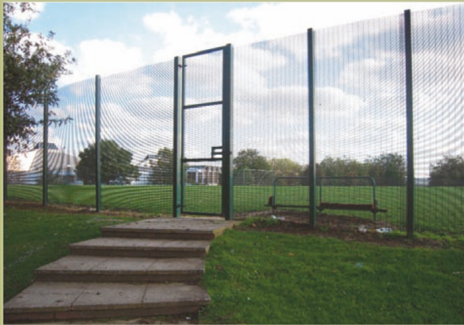
Sports Mesh fencing with pedestrian gate, powdercoated green