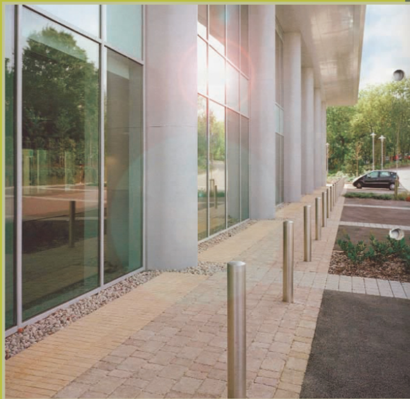
Stainless steel fixed bollards