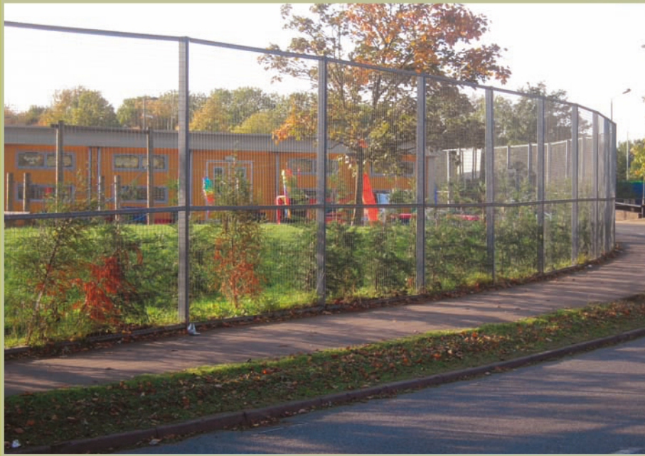
Curved mesh fencing