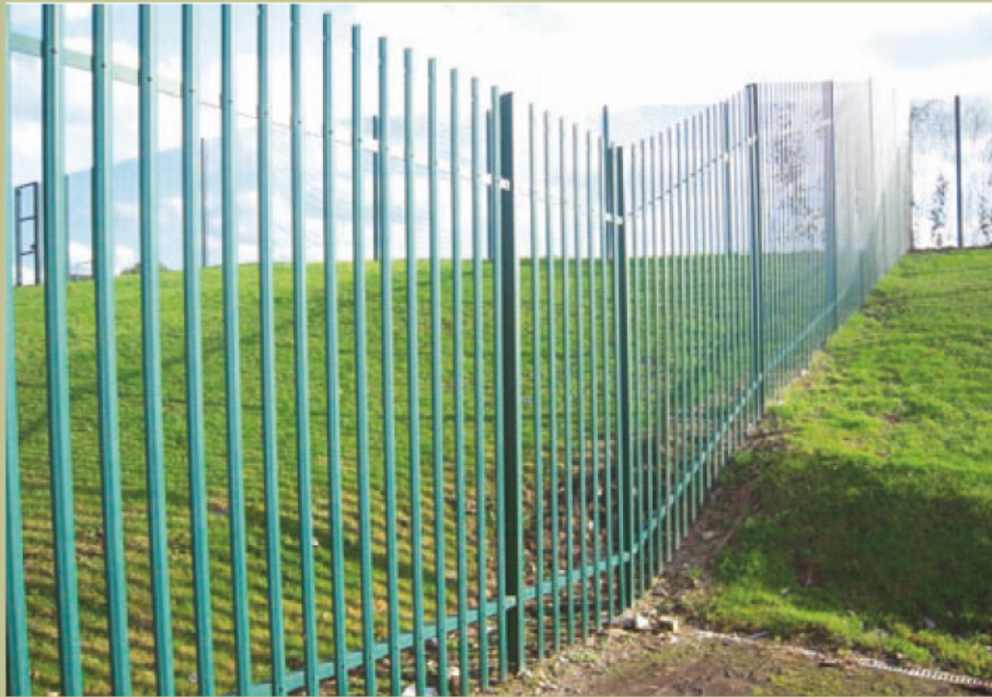
Standard green palisade, round top fencing