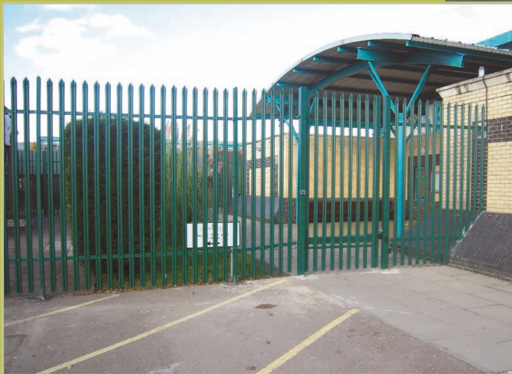
Pallisade pedestrian gate automated with access control and a hydraulic ram operator