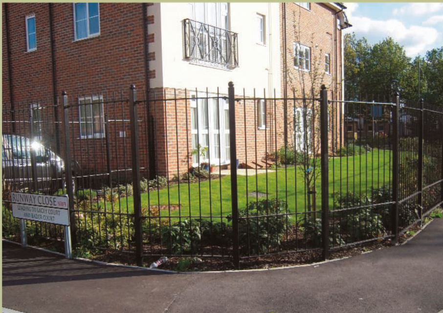
Fully welded railings to secure gardens to flats