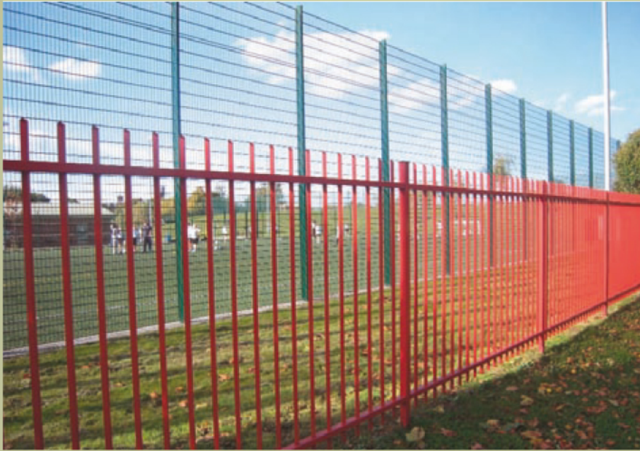
Sports mesh in standard green, with red railed fencing