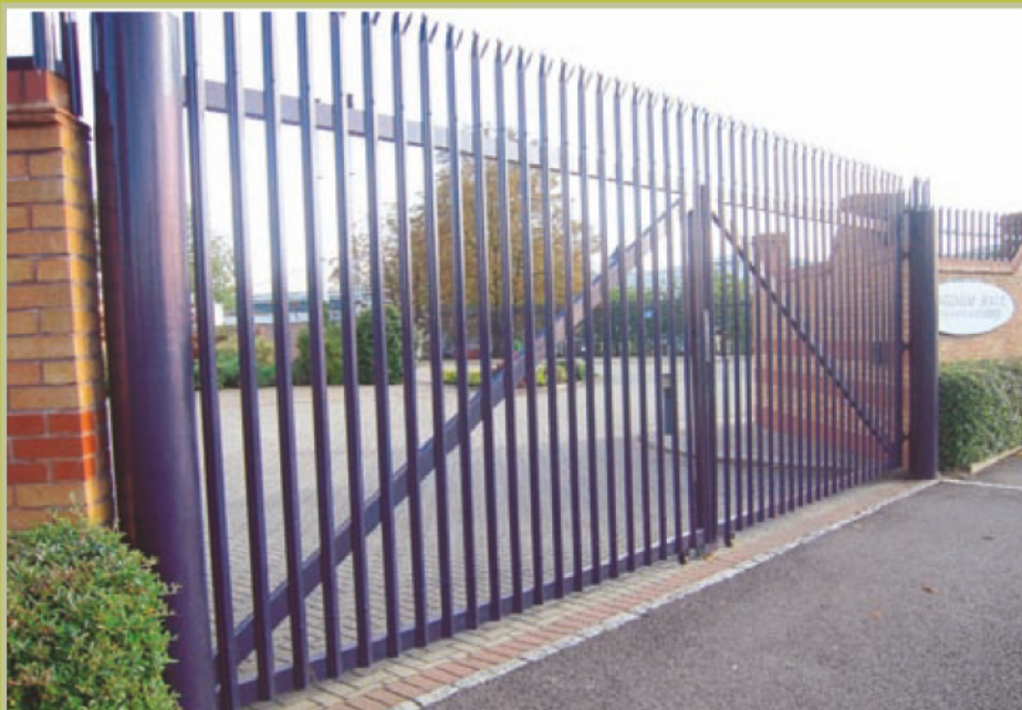
Pallisade gates with spiked top and manual operation